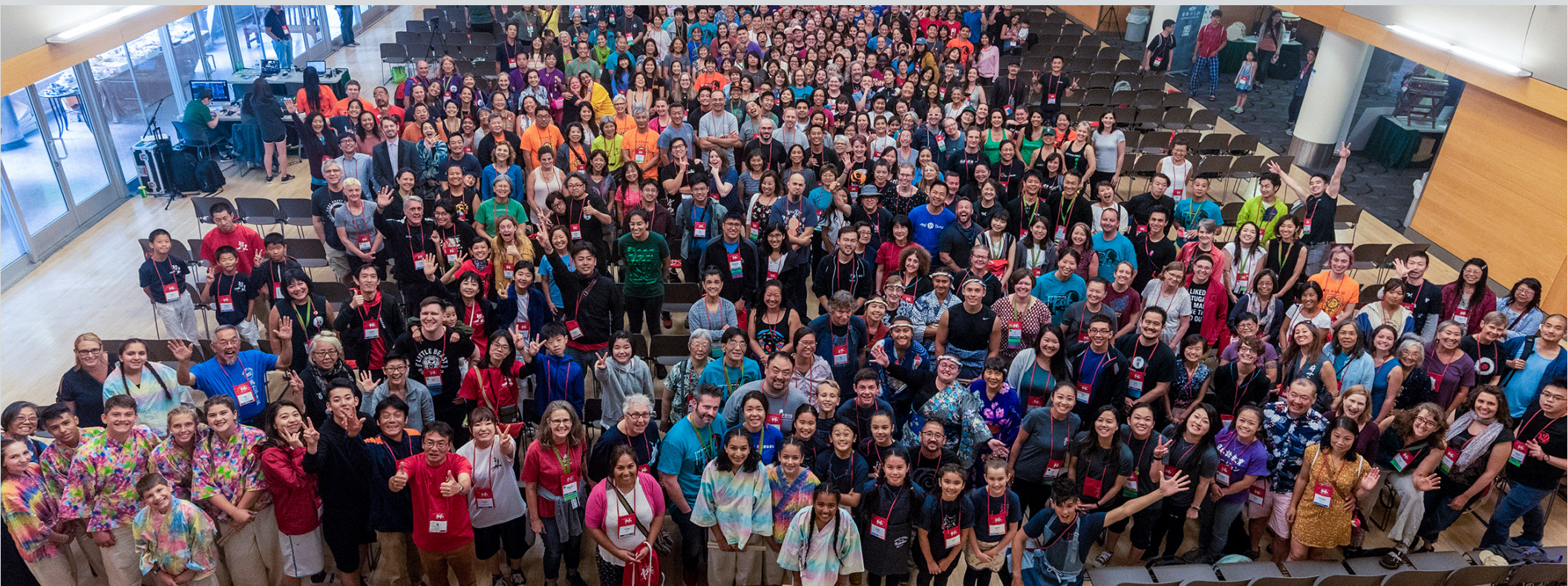
NATC 2019, Portland, Oregon, USA