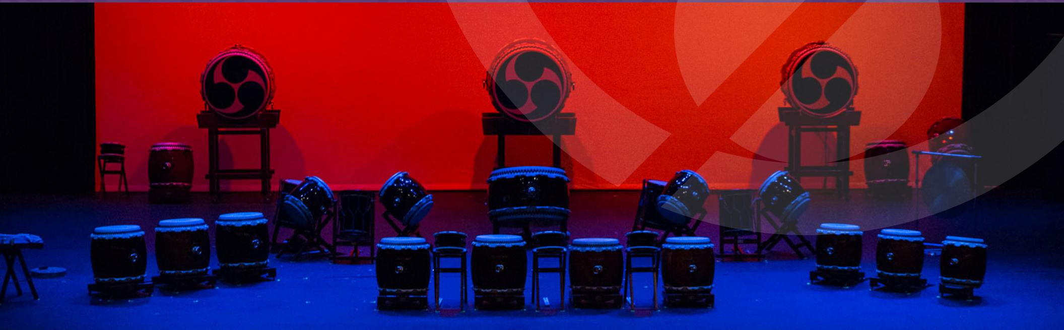
NATC 2019 Taiko Jam concert stage