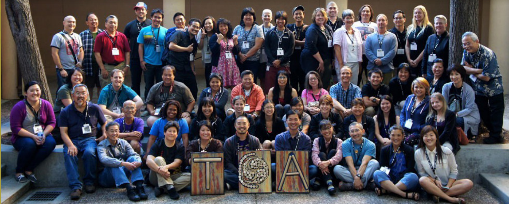
TCA Launch Meeting, Stanford University, 2013

A big drumroll to the original founding members of TCA