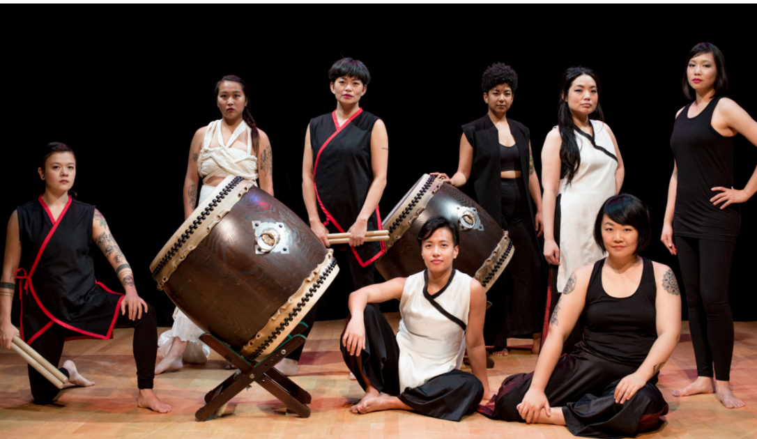
RAW group photo, recipients of a TCA Grant 2021